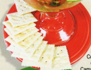
Coctel de Camarones