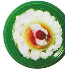
Flan caramel custard

Soft flour tortillas stuffed with melted cheese. With shredded beef or shredded chicken $3.00 extra.