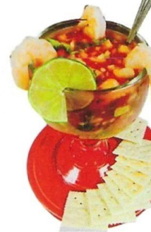
Coctel de camarones