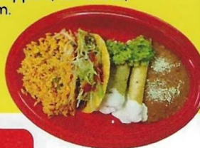
Taco Chimichanga burrito