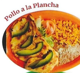
Pollo a la Plancha

Griddled chicken breast topped with avocado slices.